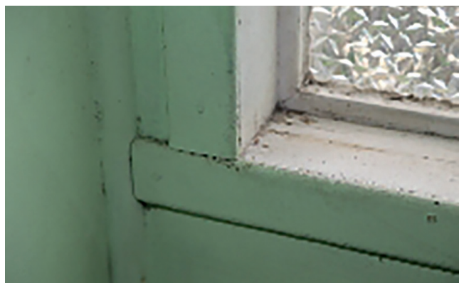
Figures 1, 2 and 3: Asbestos can be in places that you might not expect; including behind fuse boxes, in roofing, and window sills