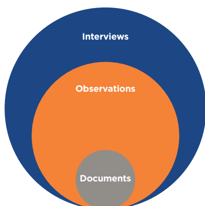
FIGURE 2: The SafePlus onsite assessment's 'deep dive' process gathers a wide range of perspectives, observes work and reviews relevant documents, to assess work culture and capability within an organisation