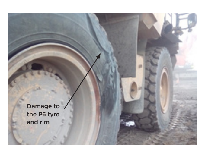
FIGURE 4: Interaction incident two