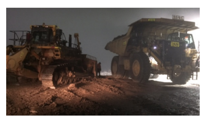
FIGURE 3: Interaction incident two