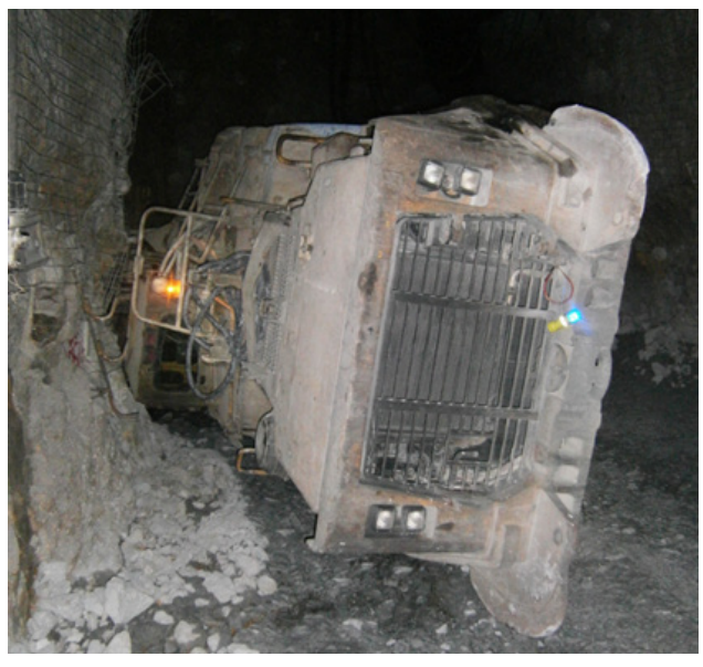
FIGURE 5: Interaction incident three