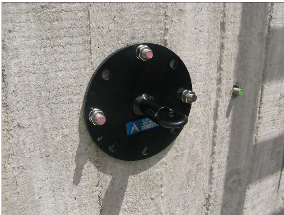
Figure 4: Chemically fixed anchor bolt