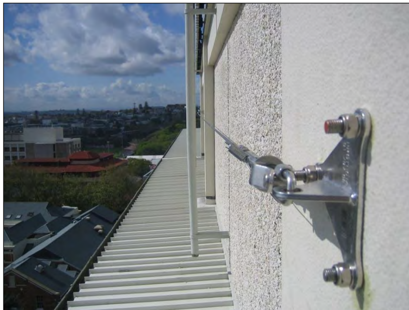
Figure 10: Proprietary horizontal lifeline