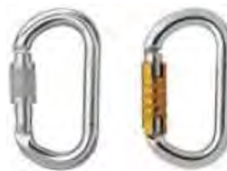
Figure 14: OK symmetrical locking carabiner with screw and triact locking systems

Pear shaped and HMS carabiners allow for a wide gate opening and offer good load distribution when packing multiple ropes or slings in them. These are good for friction hitches when managing loads.