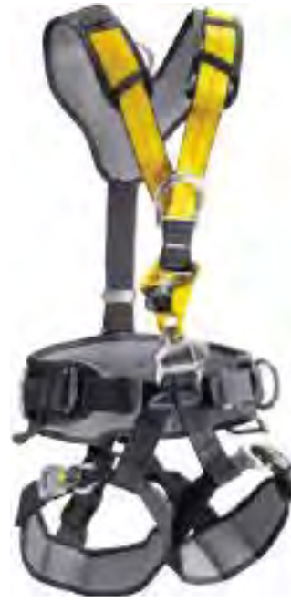
Figure 11: Navaho Bod Croll Rope Access Harness

Discomfort due to a poorly-fitted harness can greatly reduce the effective working time of an operator and may contribute to physiological problems in the event of a fall. Before using a harness for the first time, the operator should conduct a suspension test to ensure the size and adjustments are correct and that the harness has acceptable comfort levels.