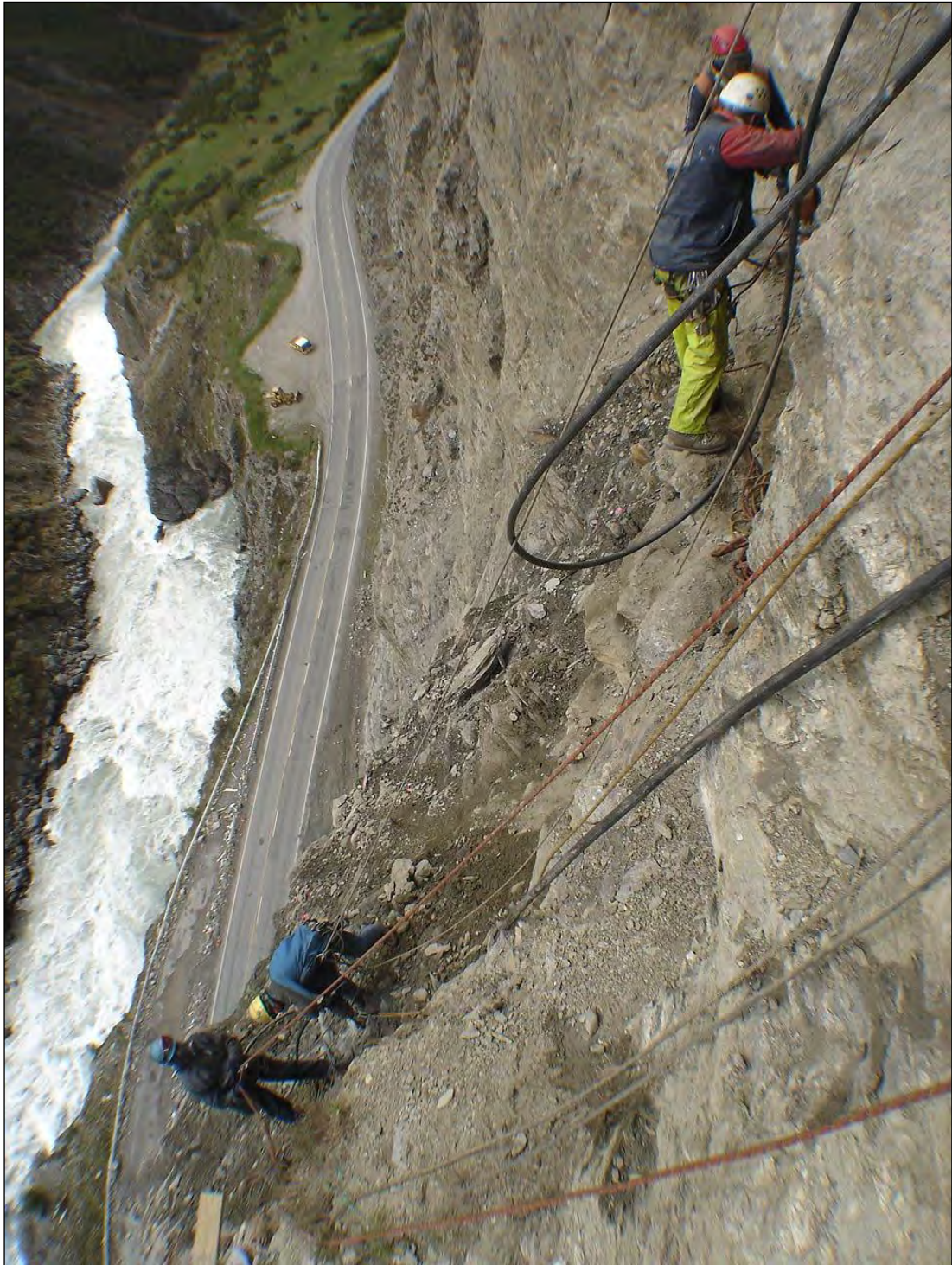
Figure 1: Abseilers undertaking geotechnical work at Nevis Bluff, Central Otago.