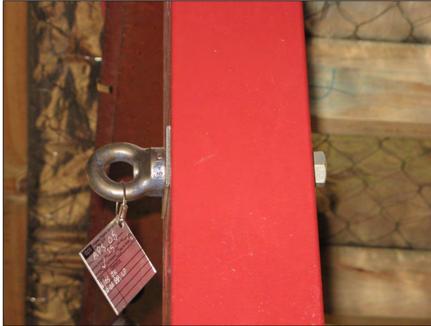
Figure 5: Through bolted anchor with tag attached