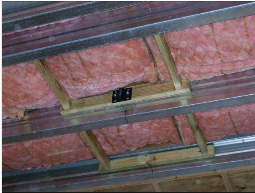
Figure 7: Structurally reinforced anchor