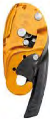
Figure 12: Rig Compact self-braking descender

Descenders (applicable standards: EN 341, EN 12841)