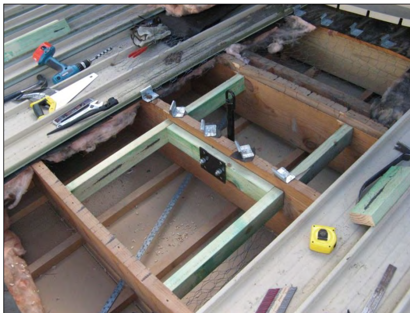
Figure 8: Structurally reinforced anchor

Structurally reinforced anchors are fitted to roof or wall framing under or behind the exterior cladding of the building. They usually involve the strengthening of the roof or wall framing to ensure that the strength of the substrate exceeds the rating of the anchor.