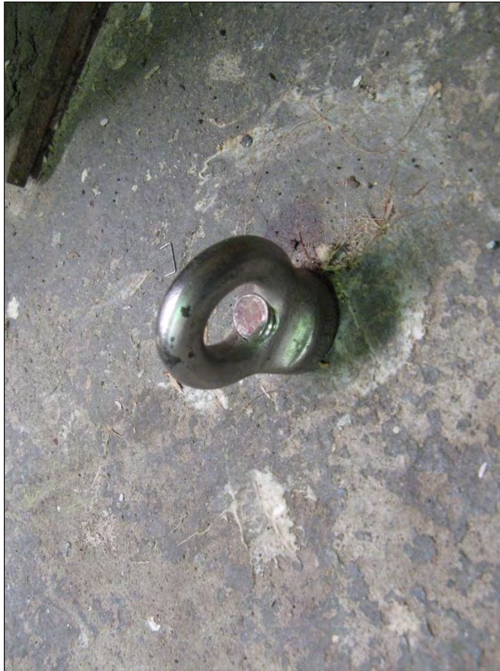
Figure 3: Chemically fixed anchor bolt