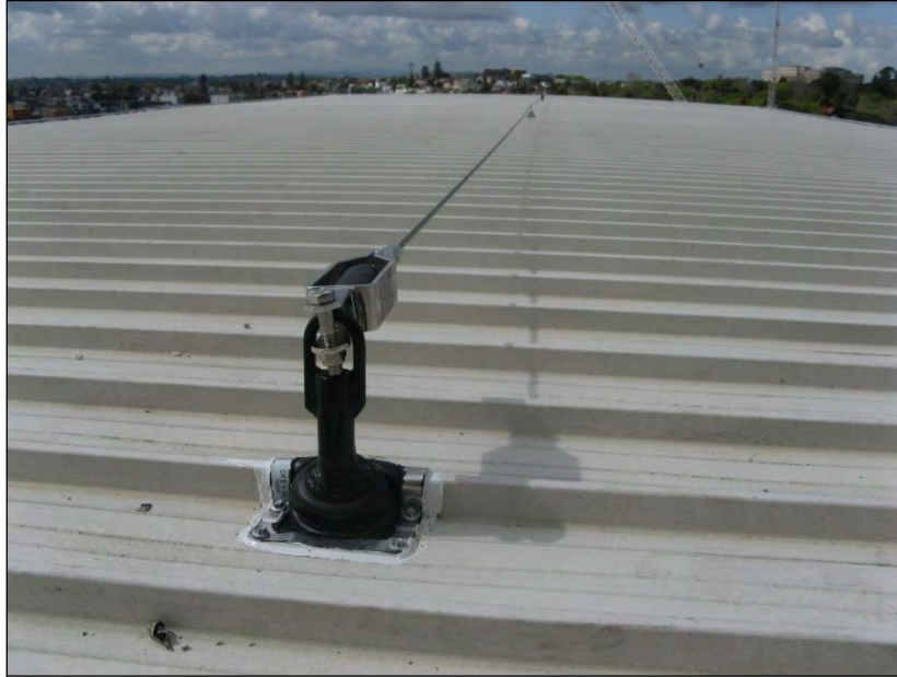
Figure 9: Proprietary horizontal line