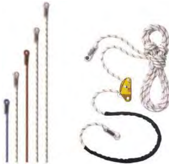
Figure 13: Grillon adjustable lanyards for work positioning

Lanyards (applicable standards: EN 354, EN 355, EN 358, AS/NZS 1891.1)