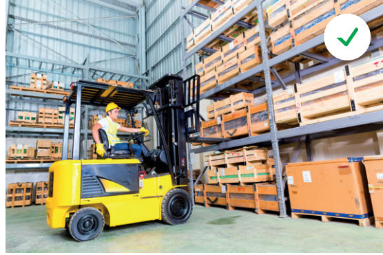
Figure 2: Use electric forklifts in coolstores and areas with poor ventilation