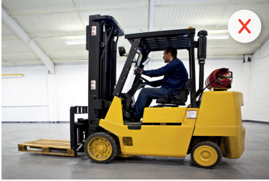
Figure 1: Avoid using LPG and other fuel-powered forklifts in coolstores and areas with poor ventilation