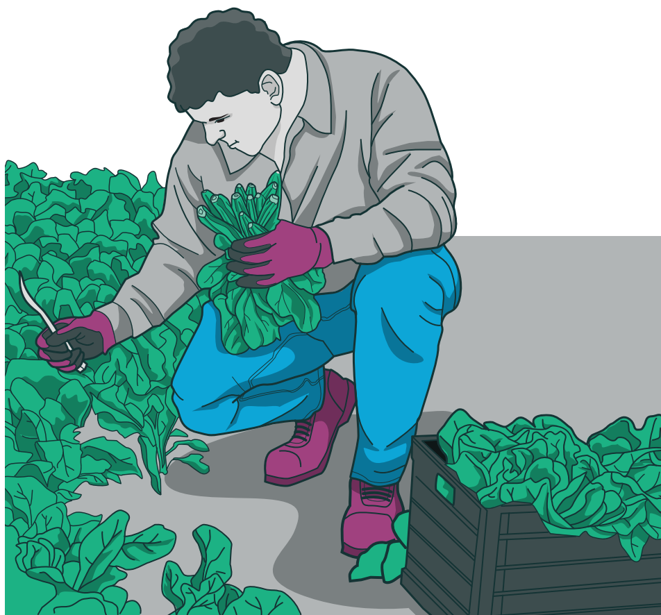
FIGURE 2: PPE for hands, legs and feet

People should wear PPE that covers hands, legs and feet (at minimum) for most activities carried out in application areas during an REI.