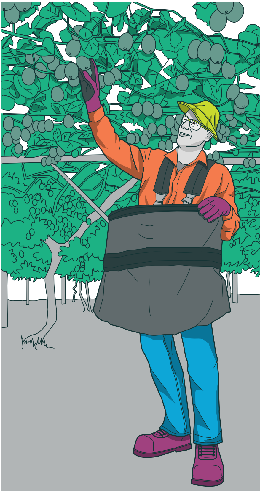
FIGURE 3: PPE for head, torso and arms

For more information about PPE, see WorkSafe's webpage Personal protective equipment (PPE)